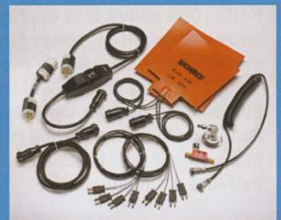
Standard Accessories (Included)

WICHITECH INDUSTRIES INC. CLEARLY SUPERIOR™